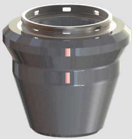
Patriot Tru-Seal · up to 240°F