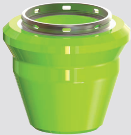
Patriot Tru-Seal HT · up to 300°F