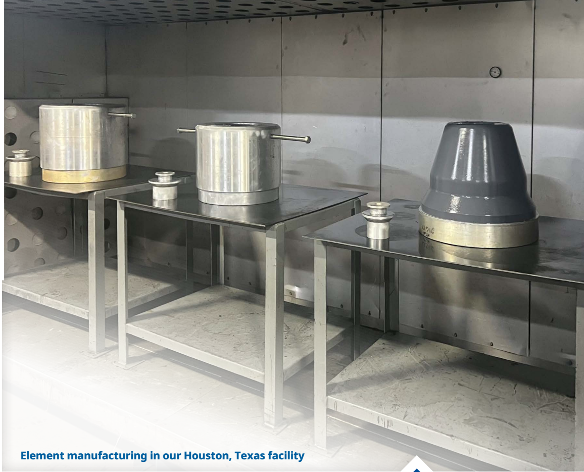
Element manufacturing in our Houston, Texas facility